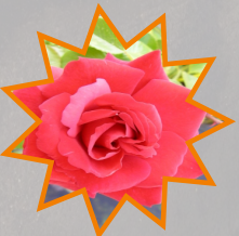
Pansies & Roses

HINTS & TIPS: Dead head bedding plants - Cut back herbs - Harvest fruit / veg - Collect seeds of poppies & forget-me-nots - Top up water features - Prune wisteria.